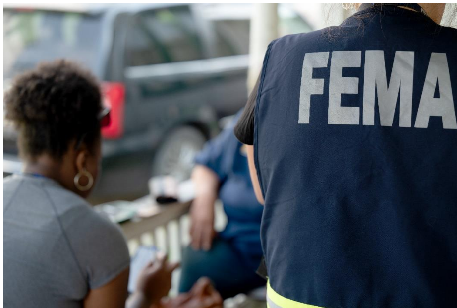
Disaster Survivor Assistance teams speaking with a disaster survivor in Tioga County

If you have received a letter from FEMA about your application status, visit a DRC to learn more about next steps. DRC staff can help you submit additional information or supporting documentation for FEMA to continue to process your application and answer any questions you may have.